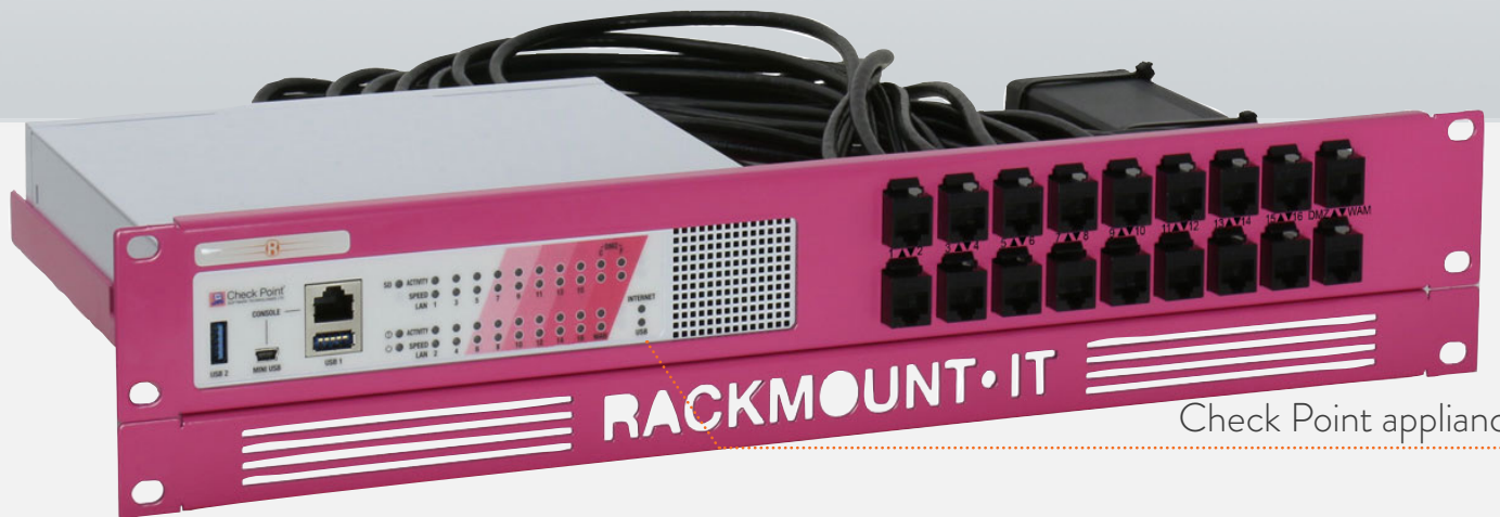
Check Point appliance

DIMENSIONS 1.3U/2U COLOR Check Point Pink PACKING DIMENSIONS 4.33 in. x 20.87 in. x 10.63 in. 11 x 53 x 27 cm PRODUCT DIMENSIONS 2.32 in. x 18.98 in. x 8.54 in. 59 x 482 x 217 mm (height x width x depth)